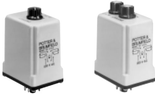
Fixed Pick-up and Adjustable Drop-out